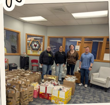
BC Food Bags