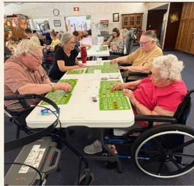
@ Bethany Home