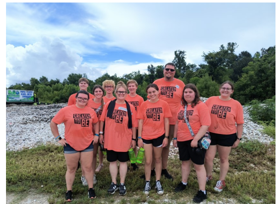
Service Day at the Oyster Recycling Plant