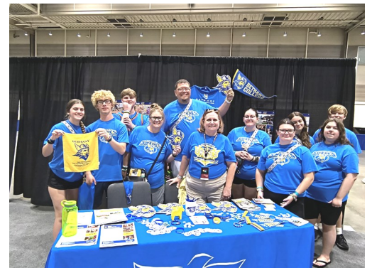
Bethany College booth in the interaction center